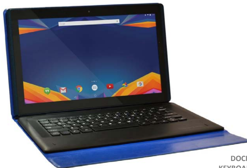
DOCKING KEYBOARD CASE