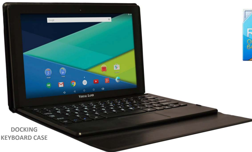
DOCKING KEYBOARD CASE