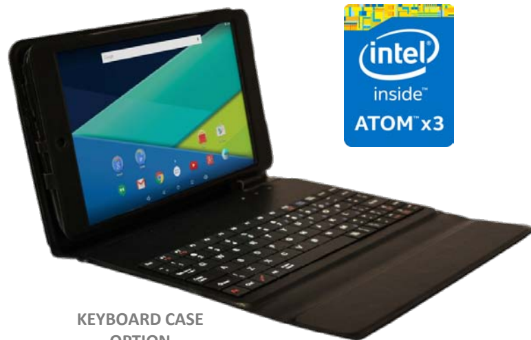
KEYBOARD CASE OPTION